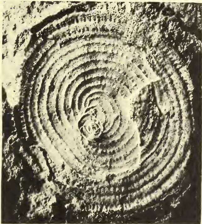
3 3 mm.